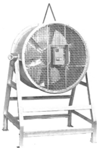
INLET END VIEW

The Dillon TLQ Super Quiet industrial fan is designed and built to provide high performance in extremely hostile environments at drastic reductions in operating noise levels.