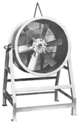
WITH OUTLET GUARD